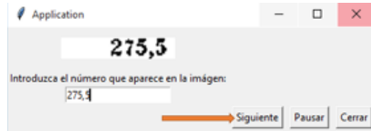
Figure 1. Task Sample