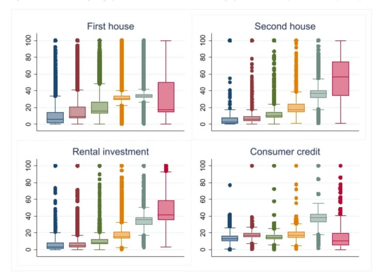
Figure 2: Credit shares (in %) by lenders, borrowers, and credit category - Distribution by bank branch-quarter pairs

Note: Authors' calculations. Period from 2012:Q4 to 2019:Q3. Each point represents a bank branch-quarter pair. Table 5 and this Figure follow the same distribution by income groups, namely 0-20, 20-40, 40-60, 60-80, 80-95 and 95-100.