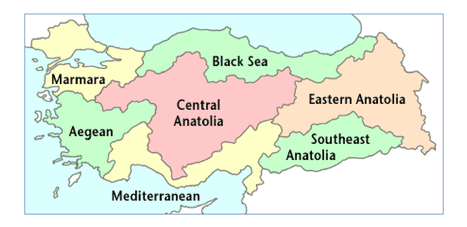
Figure 2. Map of Turkey